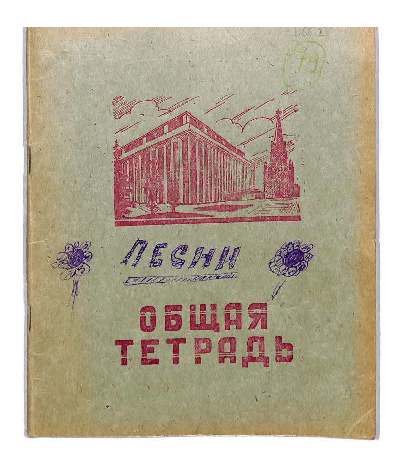
Ill. 8. The cover of JSul.I.55.02.